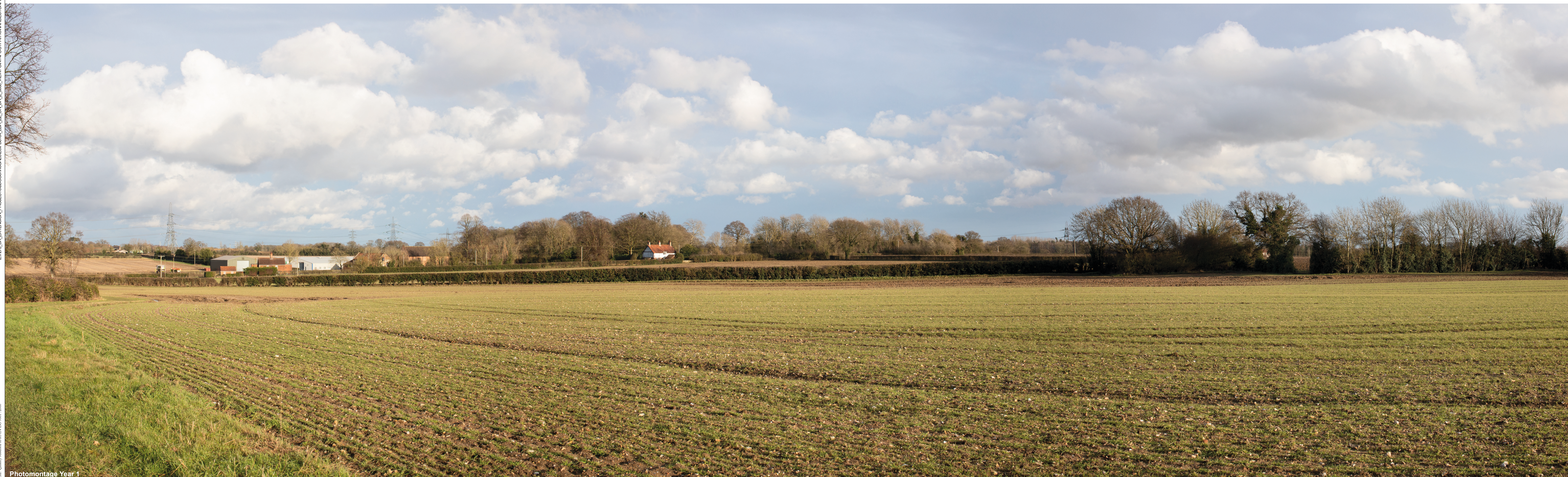
Photomontage Year 1

27273_LK_EXTENSION_PROJECTS\6005\VISUALS\ES\PB164_LDA_ZZ_ON_DR_Z_0055_VIEWPOINT\FOOTPATH\SWARDESTON\FP6\INDO